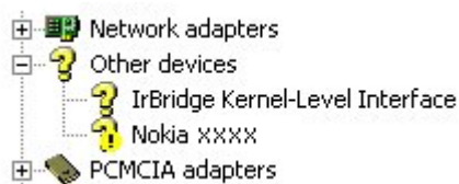
Figure 3. Unknown device (xxxx stands for the four-digit model number of your phone)