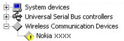
Figure 2. Unsuccessful installation (xxxx stands for the four-digit model number of your phone)